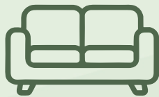
Comfy Common Rooms

All accommodation is fully supervised by experienced staff, with player welfare and safety as the top priority. Staff are available at all times to ensure every participant feels comfortable, supported, and included.